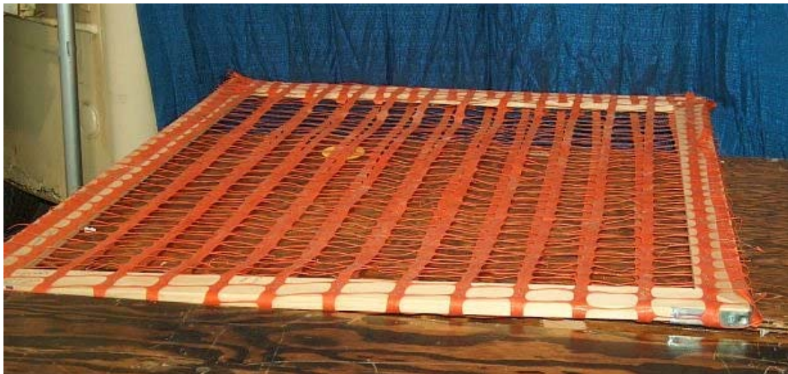
Grading Screen

It is helpful to have a skirting table and grading screen. A grading screen can be made inexpensively using 4' long thin boards (lath would do) and some fencing (e.g., chicken wire or snow fence) or other material with one inch openings. You may want to double the fencing material, with a board around the perimeter between the two layers. This type of surface makes it easy to shake debris and second cuts from the fleece. Set your grading screen on your skirting table, so it is at a convenient height.