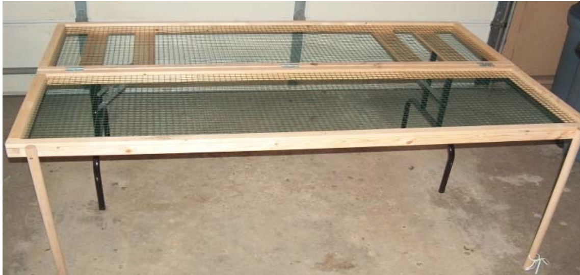
Skirting Table – owned by June Black

Skirt as you shear, and you will have less work. If you haven't done so while shearing, now is the time to remove belly hair, lunch box, and possibly the backbone hair (if it is damaged). These can be saved in a bag labeled "2 nd quality." You may want to use them for rugs or other items not worn next to the skin.